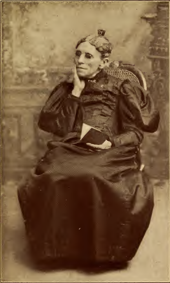
Fanny Crosby at Seventy-five